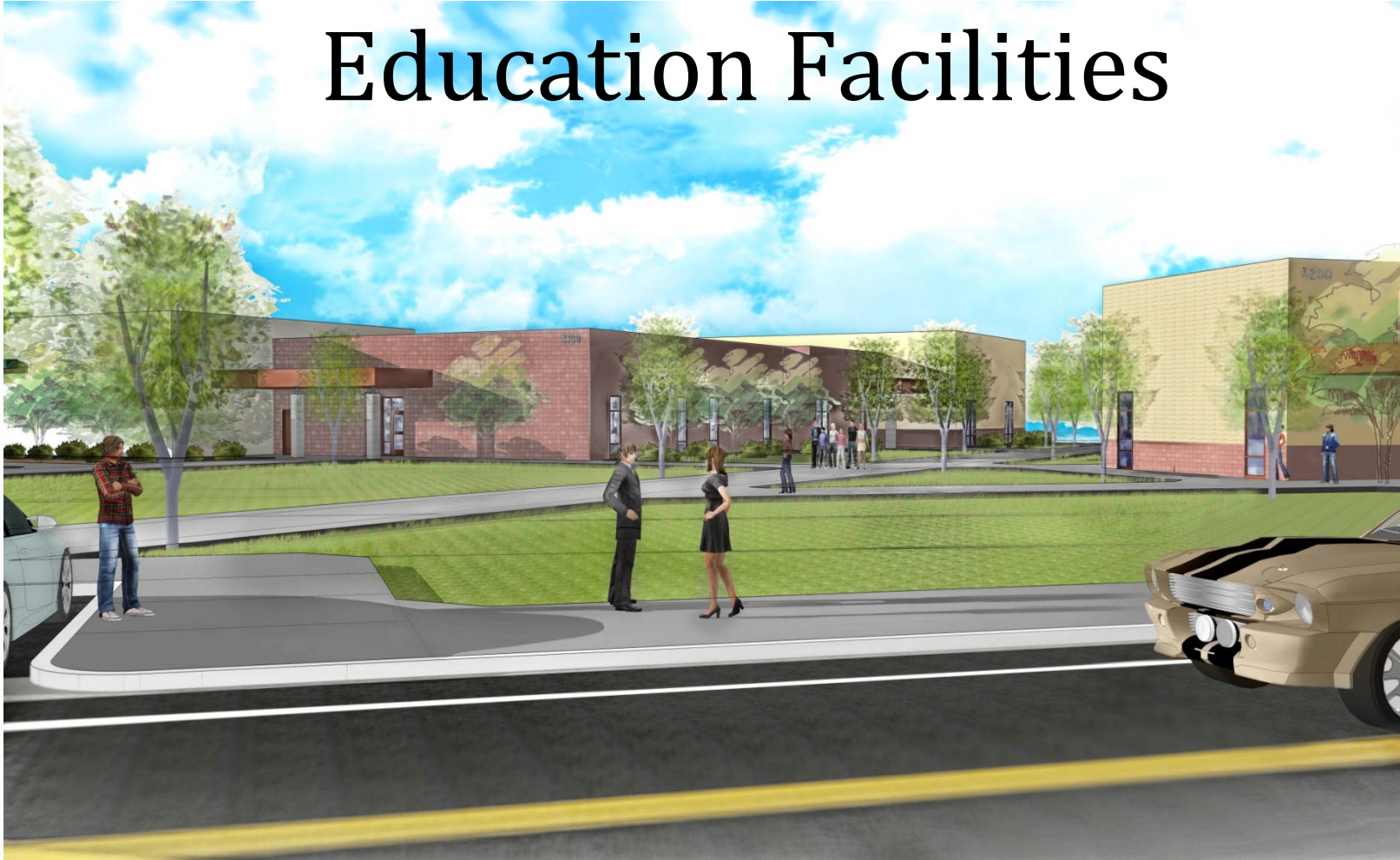
3100 & 3200 Buildings - Design Rendering