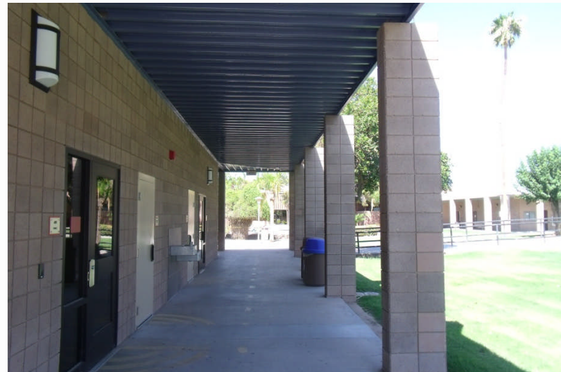
400 Building Interior & Exterior