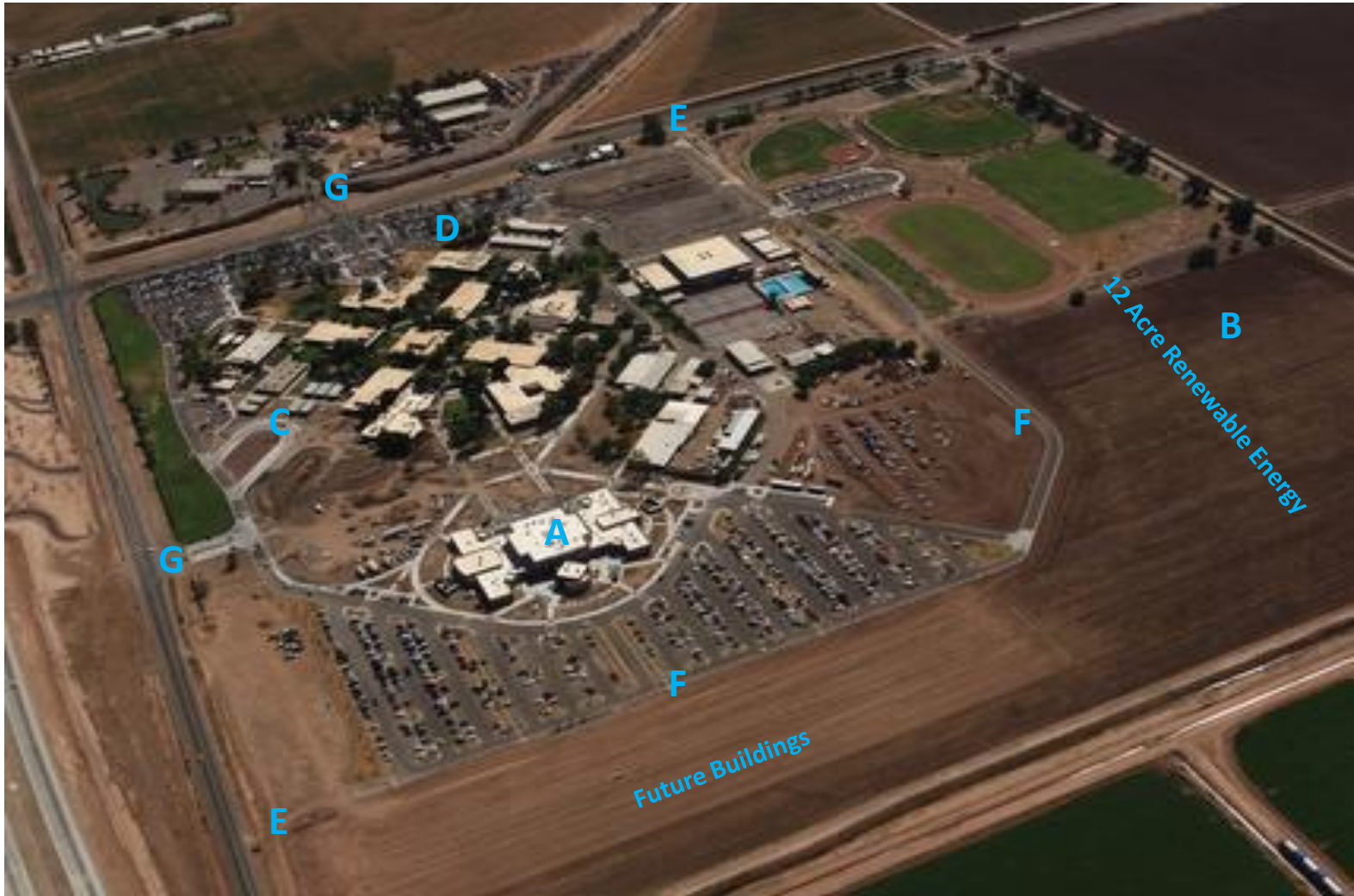
AERIAL PHOTO AUGUST 2009