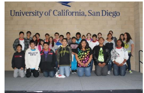
Middle School Participants