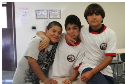
Middle School Participants