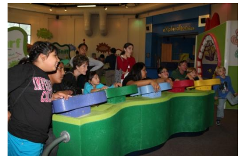
Middle School Participants

The students had the opportunity to go on a fieldtrip to UCSD. They got a guided tour of the campus and were able to speak to actual university students and ask questions about the campus, programs offered, and university life in general.