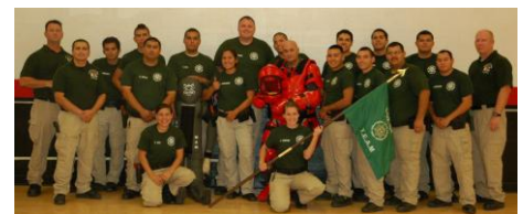
POST Level II Students

A total of 58 students graduated in December from the IVC POST program! This includes students from both Level II and Level III.