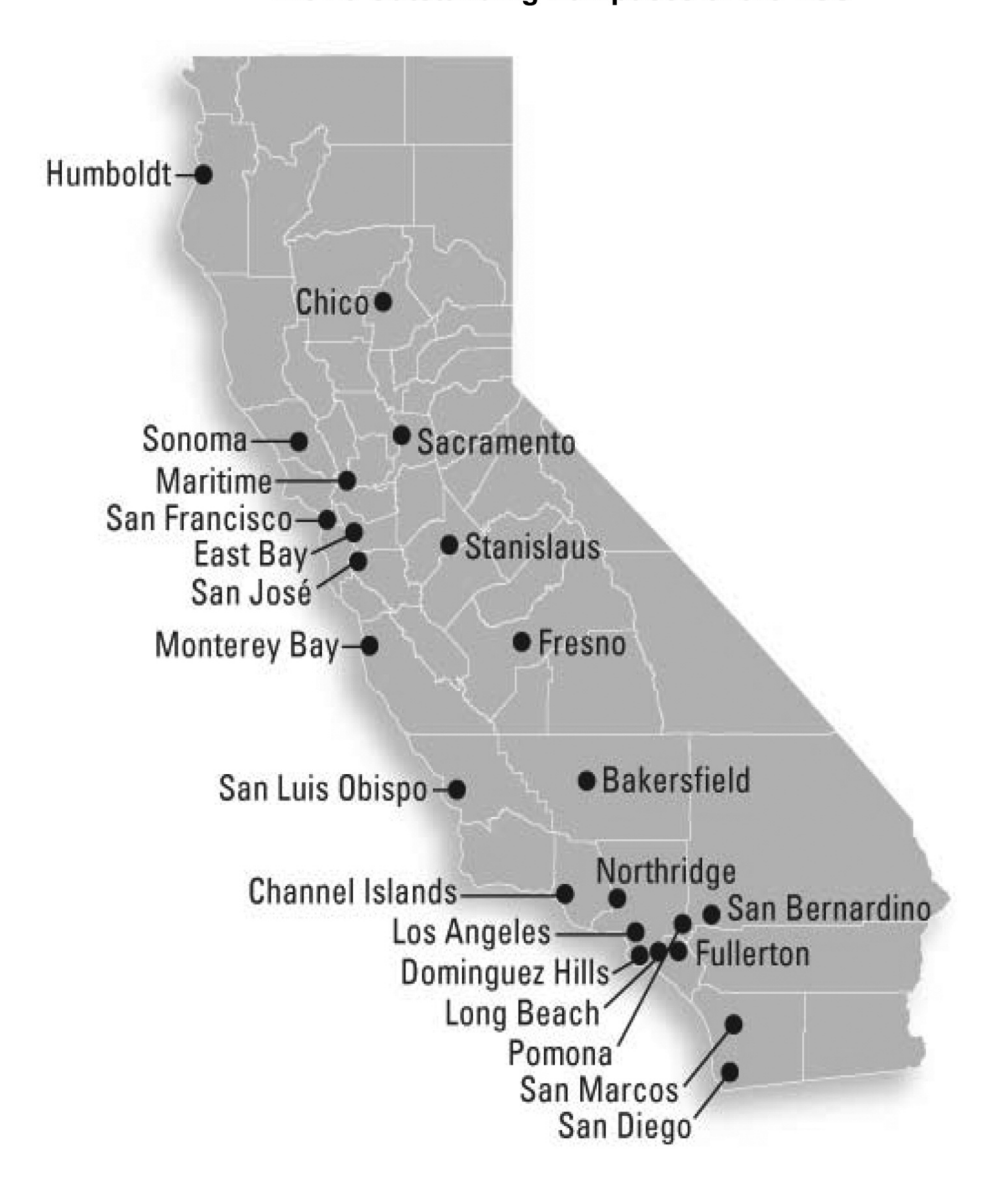
The 23 Outstanding Campuses of the CSU

<u>Certification is not automatic.</u> Students must request certification from IVC's Admissions Office. Completed general education courses will be reflected on this form and attached to each transcript sent to a CSU campus.