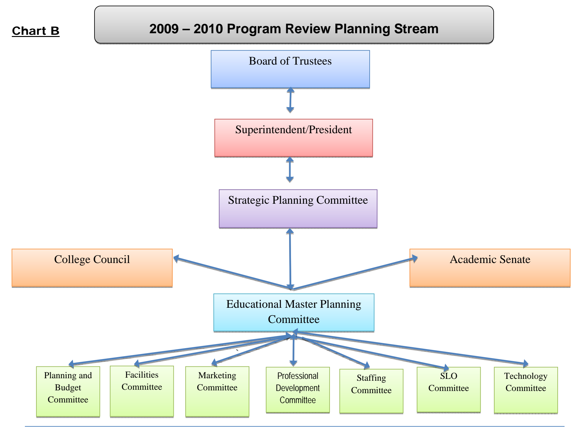
Imperial Community College District Progress Report, October 15, 2009