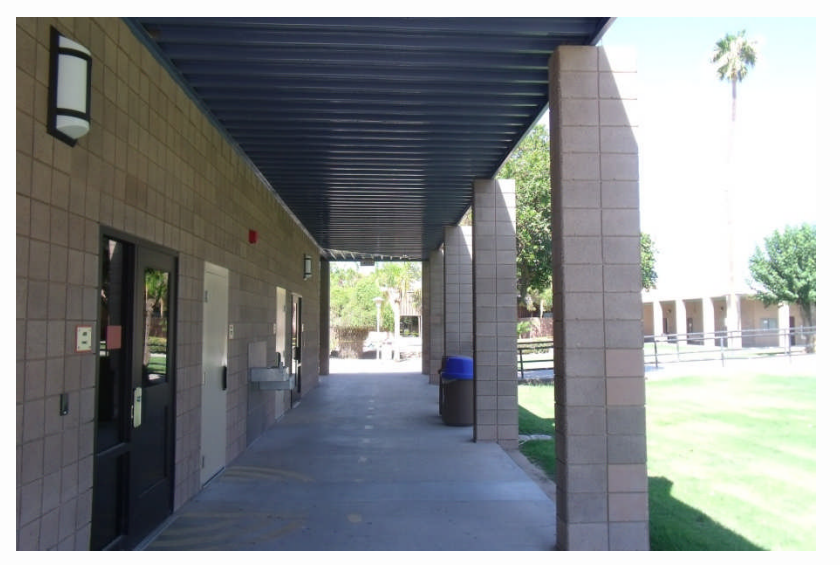
400 Building Interior & Exterior