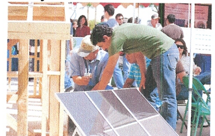
Applied Sciences Expo