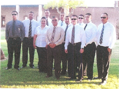
Reserve Officer Level II Graduates

students graduated from our Reserve Officer Level II course, the highest module IVC offers thru California's POST Program.