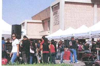
2008 Applied Sciences Expo

The Applied Sciences Expo was held on April 24 th with over 70 exhibitors and over 1200 students in attendance. Students learned about many different career options.