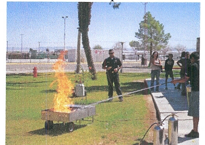
Student putting out a fire

Also, Fire Technology taught students how to put out fires.