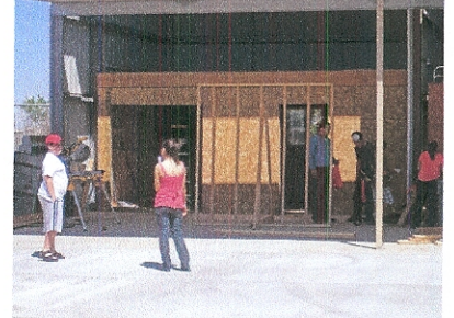
Students learning construction by helping to build a storage room

Another example, Building Construction had students help build parts of a storage room that will be used to store tools and supplies.