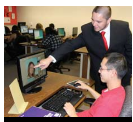
Not sure you want to be a trainer? Aside from the financial rewards, there is the added reward of working closely with colleagues from across campus.

• Goal #3: Develop resources to increase the college's effectiveness by improving the technology infrastructure and by training faculty, administrators, counselors, and staff to make the most effective use of this infrastructure.