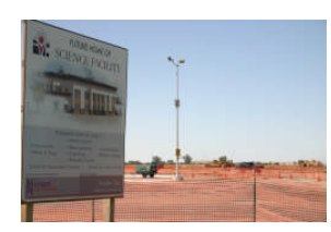
North Parking Lot Construction