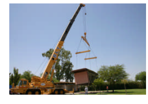
Relocation of Math Lab