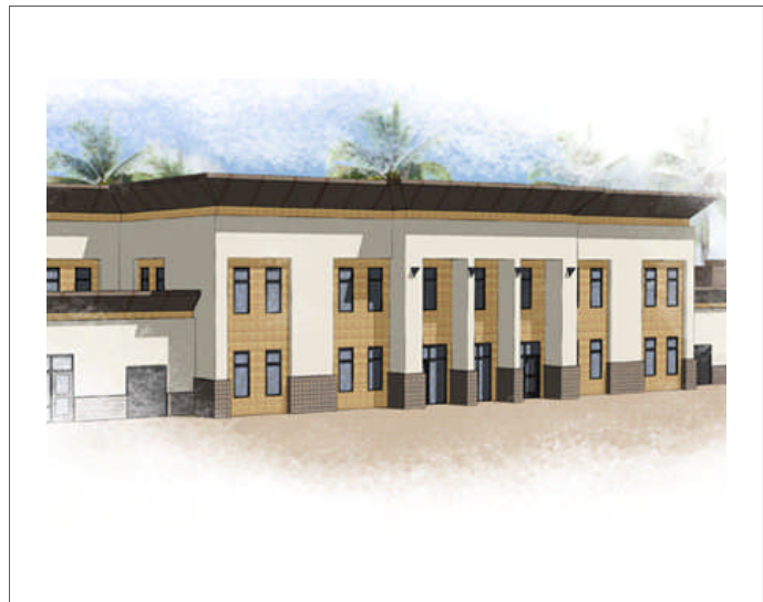
Future Home of the Imperial Valley College Science Facility

The meetings are facilitated by the Vice President for Business Services, with reports on expenditure provided by the Business Office, reports on